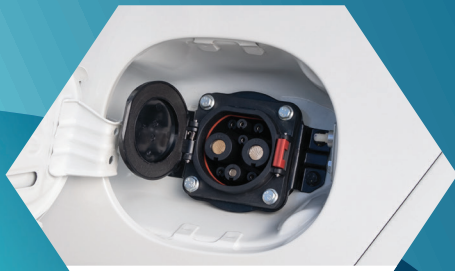
Fast charging socket