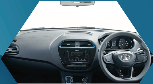
Premium black interior theme with automatic climate control