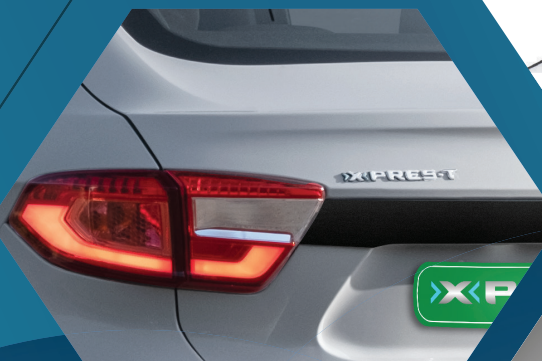
Led tail lamps