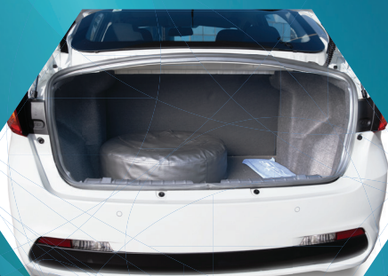
255L boot space