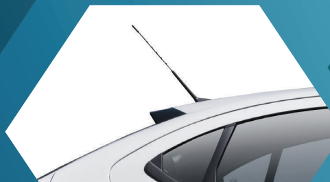
LED high mounted stop lamp