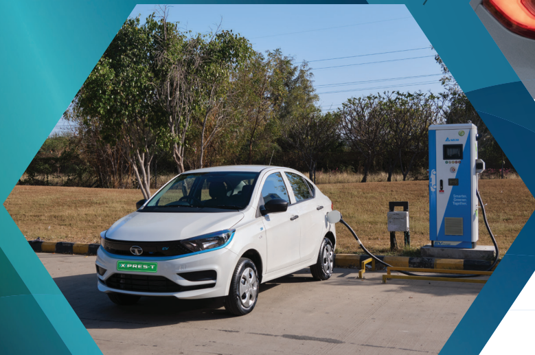
Fast charging 0 to 80% in 1 hr 50 min*