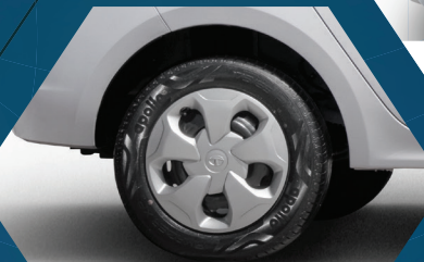
Stylish wheel rims