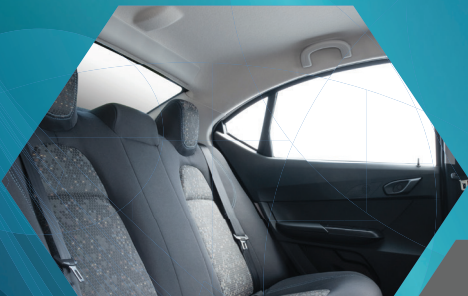
Premium fabric seats