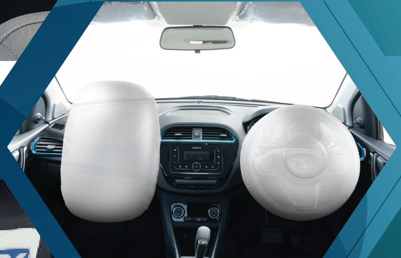
Enhanced safety with dual front airbags