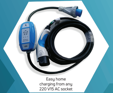
Easy home charging from any 220 V15 AC socket