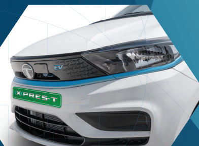
EV accent themed grille