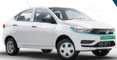
Breakfree coupe-inspired roof line