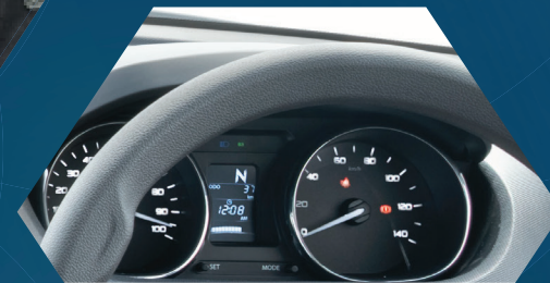
Chrome ringed instrument cluster with high-resolution, segmented driver information system