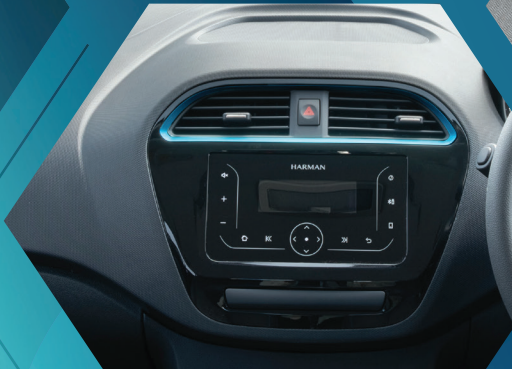
Impressive sound experience by Harman tm**