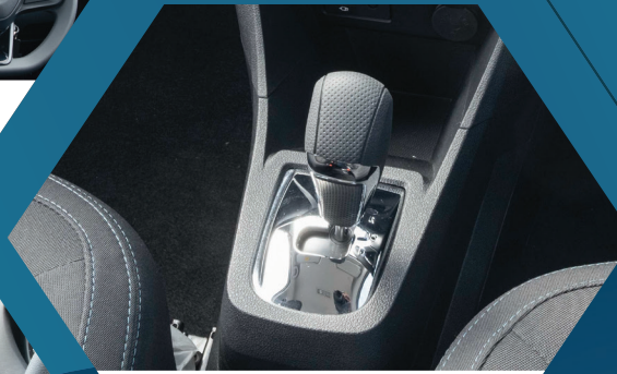
Single speed transmission with sport mode, drives like automatic