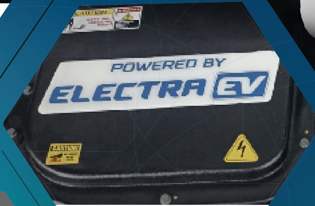
High energy density 25.5 kWh battery for greater driving range on a single charge