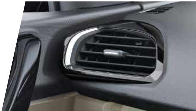
CHROME LINED SIDE AIRVENTS