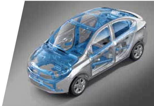
ENERGY ABSORBING STRUCTURE