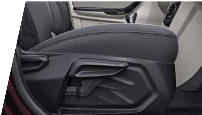
HEIGHT ADJUSTABLE DRIVER SEAT