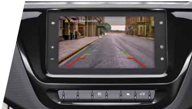
REAR PARKING ASSIST WITH CAMERA