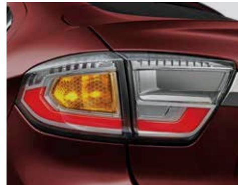
BOLD & BRIGHT LED TAIL LAMPS