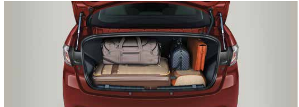
419L BOOT SPACE