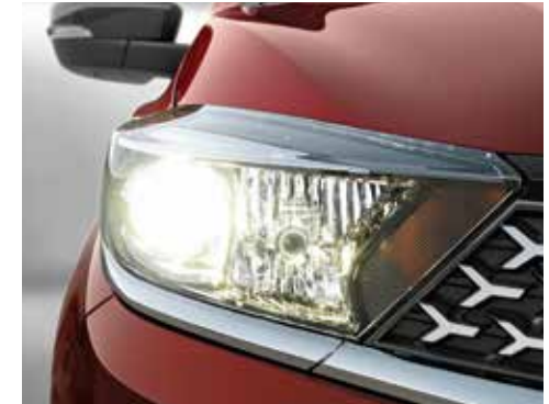
AUTOMATIC HEADLAMPS CONTROL