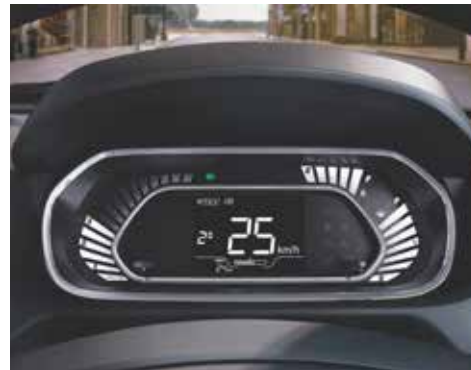
DIGITAL INSTRUMENT CLUSTER