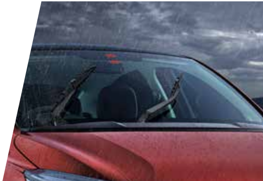
RAIN SENSING WIPERS