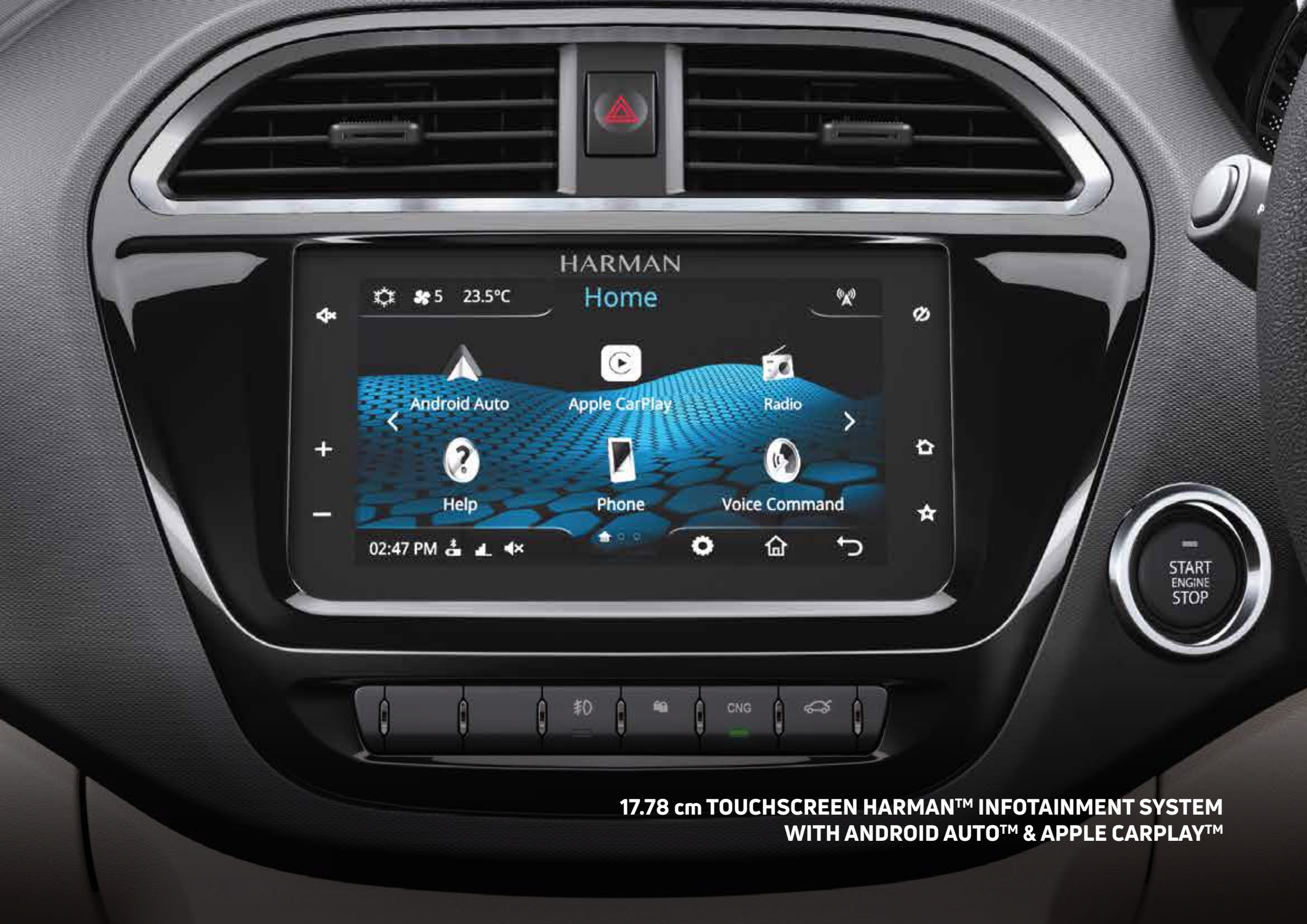
17.78 cm TOUCHSCREEN HARMAN™ INFOTAINMENT SYSTEM WITH ANDROID AUTO™ & APPLE CARPLAY™