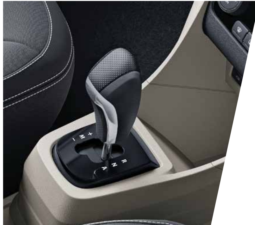
ADVANCE AMT TRANSMISSION