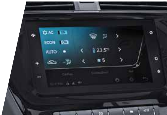
FULLY AUTOMATIC CLIMATE CONTROL