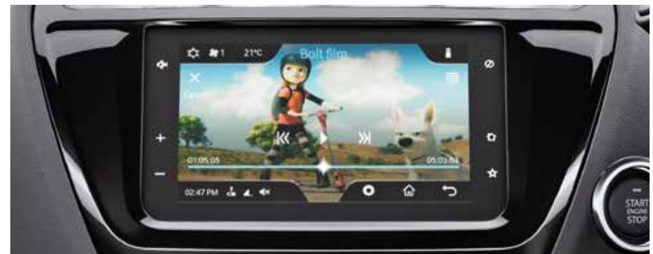
IMAGE & VIDEO PLAYBACK