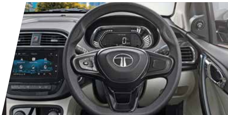
STEERING MOUNTED CONTROLS