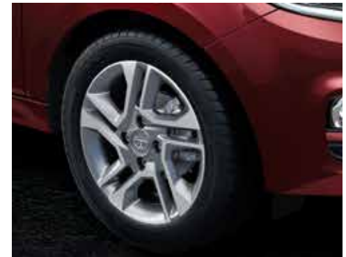
R15 SONIC SILVER ALLOY WHEELS