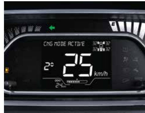
TYRE PRESSURE MONITORING SYSTEM