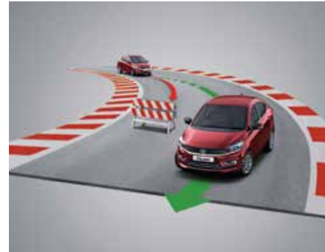
ABS WITH EBD AND CORNER STABILITY CONTROL