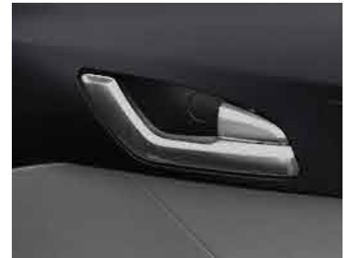
FRONT & REAR CHROME DOOR HANDLES