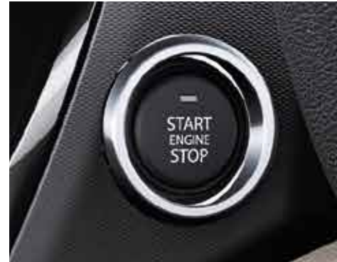
ENGINE START/STOP PUSH BUTTON