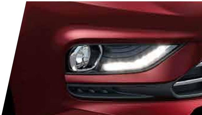
STRIKING LED DRLs