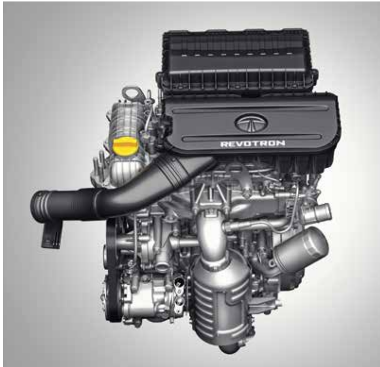
1.2L REVOTRON BS6 PH2 ENGINE