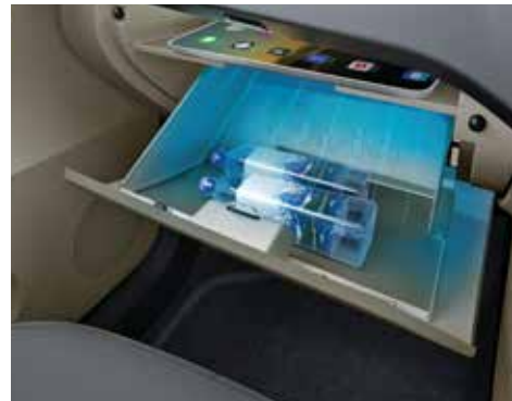
COOLED GLOVE BOX