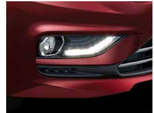
FRONT FOG LAMPS WITH CHROME RING SURROUNDS