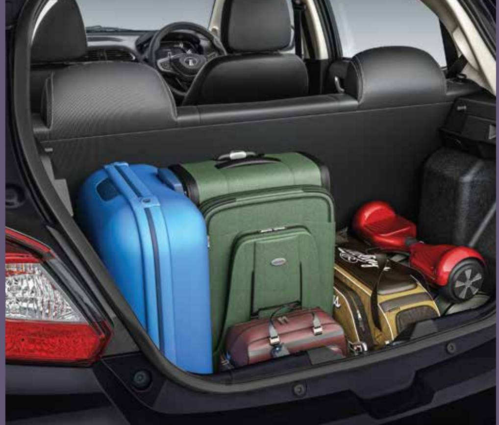
242 l Boot Space